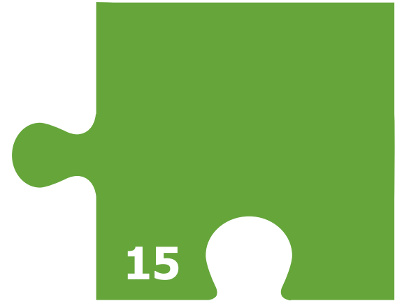
Practice & Industry Groups